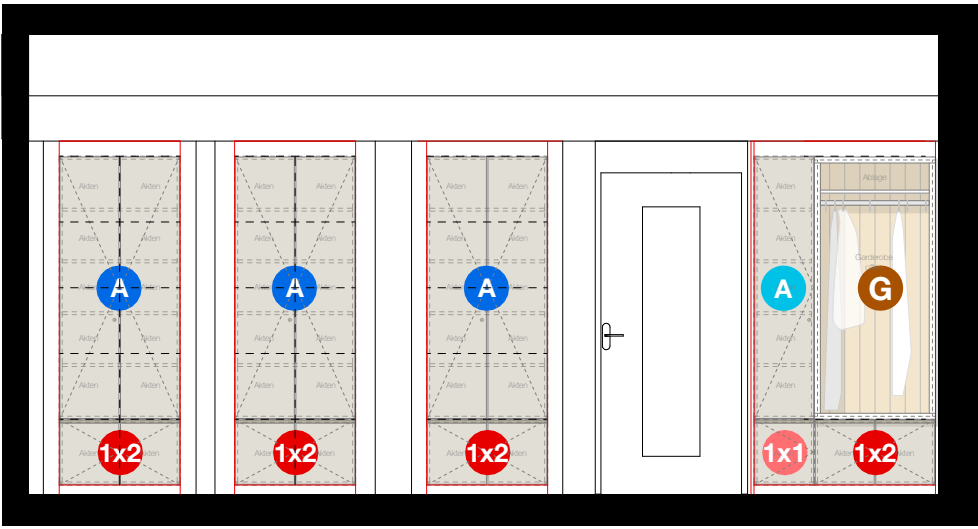
Wandabwicklung A OG03.031